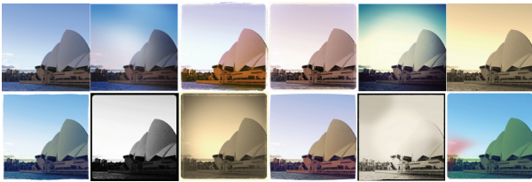
Figure 1: Example of an original photo (top left photo) and many filtered variations. Some filters change contrast, brightness, saturation; some add warmth or cool colors or change the borders.

one. After understanding how producers perceive and use filters, we take an additional step to examine role of filters in engaging photo consumers. We find that filtered photos are considerably more engaging than original ones—with filters that increase warmth, exposure and contrast boosting engagement the most. Our work explores a new path toward understanding social aspects of photowork. The findings of this work also provide several design implications, such as designing effective filters for both serious and casual use cases.