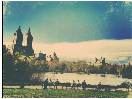
Figure 3: Participant describes how the filter surprised her with a new look for the photo that she did not imagine while taking the photo (Photo used by permission of the participant).

“Generally, if it’s in a group shot, it’s about capturing the memory of that moment, I wouldn’t apply filters on it. I would try to keep it as original as possible. It’s not for the art. It’s for capturing the moment.” (P2)