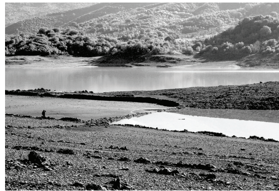
Figure 2: Participant describes how the black and white filter helped him show the roughness of the landscape.

Sometimes these fun and unique looks are not imagined by the photographer or not intended until when the filter is applied: